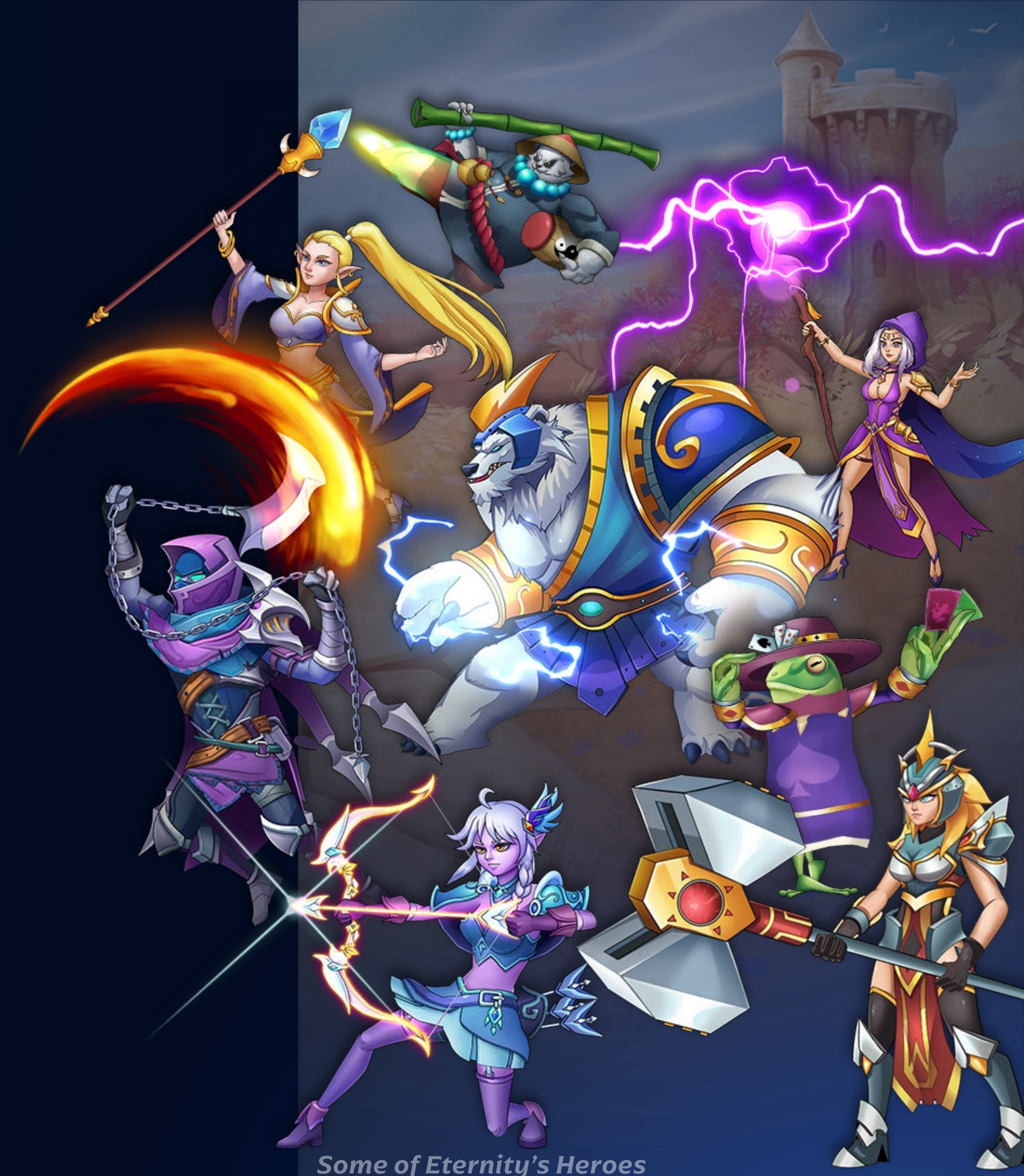
Some of Eternity's Heroes

All Heroes are NFTs and can be traded in the game's Auction house or any other secondary market (i.e.: OpenSea).